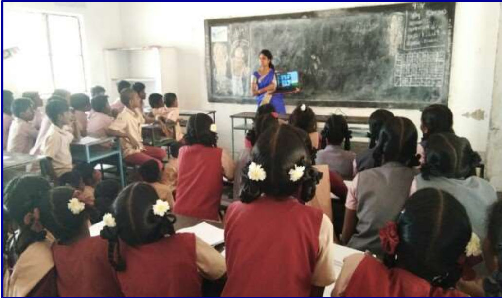
Extension Service entitled "Microsoft Office" - 01.02.2019