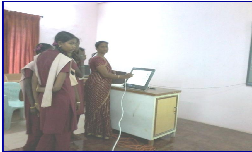
Consultancy Programme on "Internet Access" - 02.08.2017