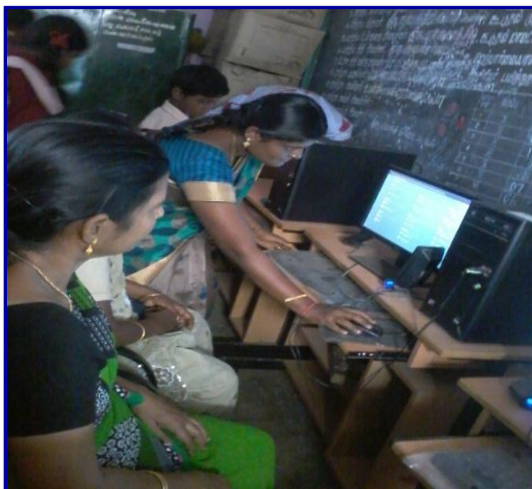
Extension Programme on "Online Shopping using Wallet"-30.01.2018