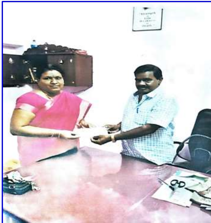
Consultancy Activity entitled "GST E-Filing and Income Tax e-Filing" @ Indira Agency, Madurai - 04.10.2021 & 05.10.2021