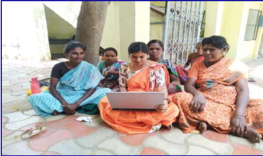
Consultancy Activity on “How to Apply Online Train Ticket”