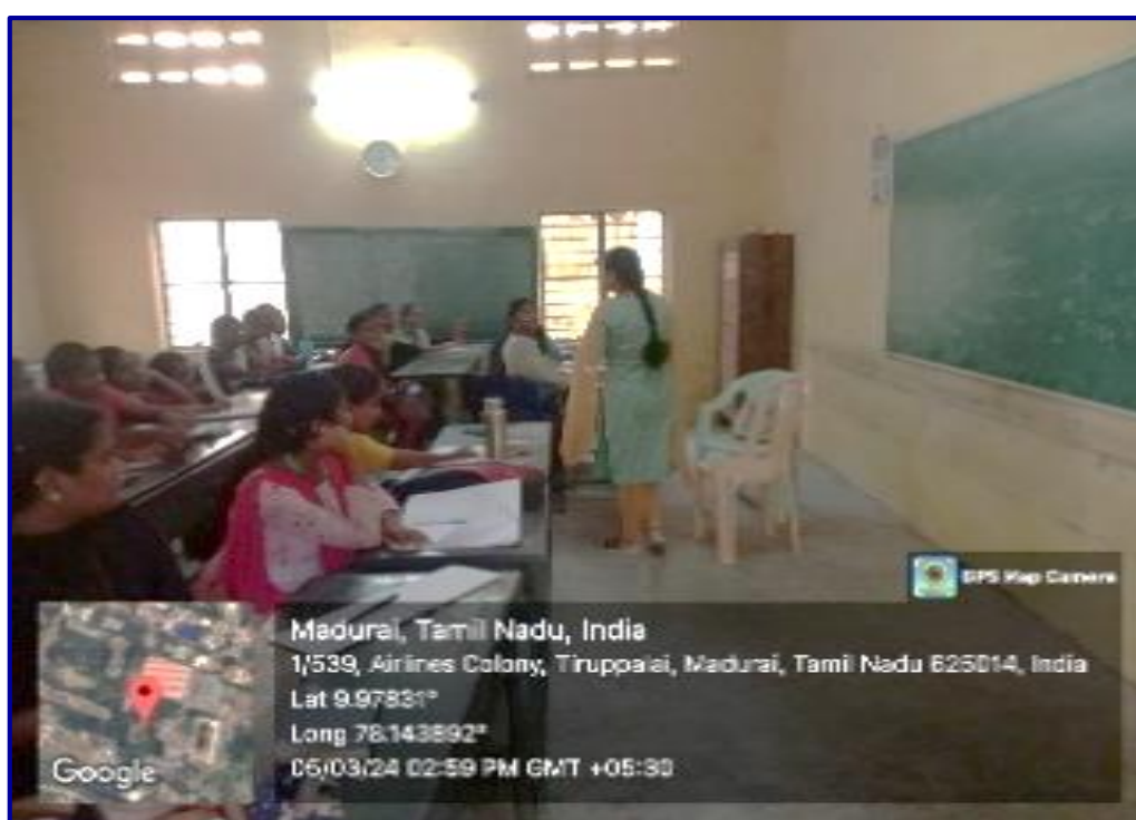
The Career Guidance & Placement Cell, EMGYWC organized a Personality Development Classes for all major final year students from 02.03.2024 to 07.03.2024