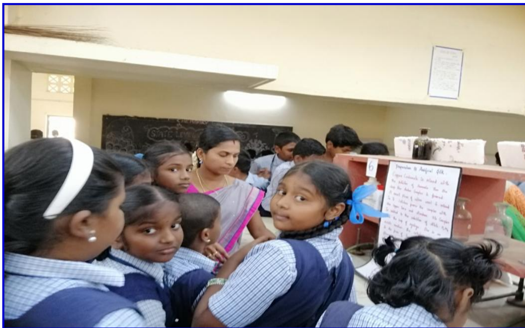
Consultancy Activity on “Preparation of Natural Plastic Using Corn Starch” – 15.02.2019