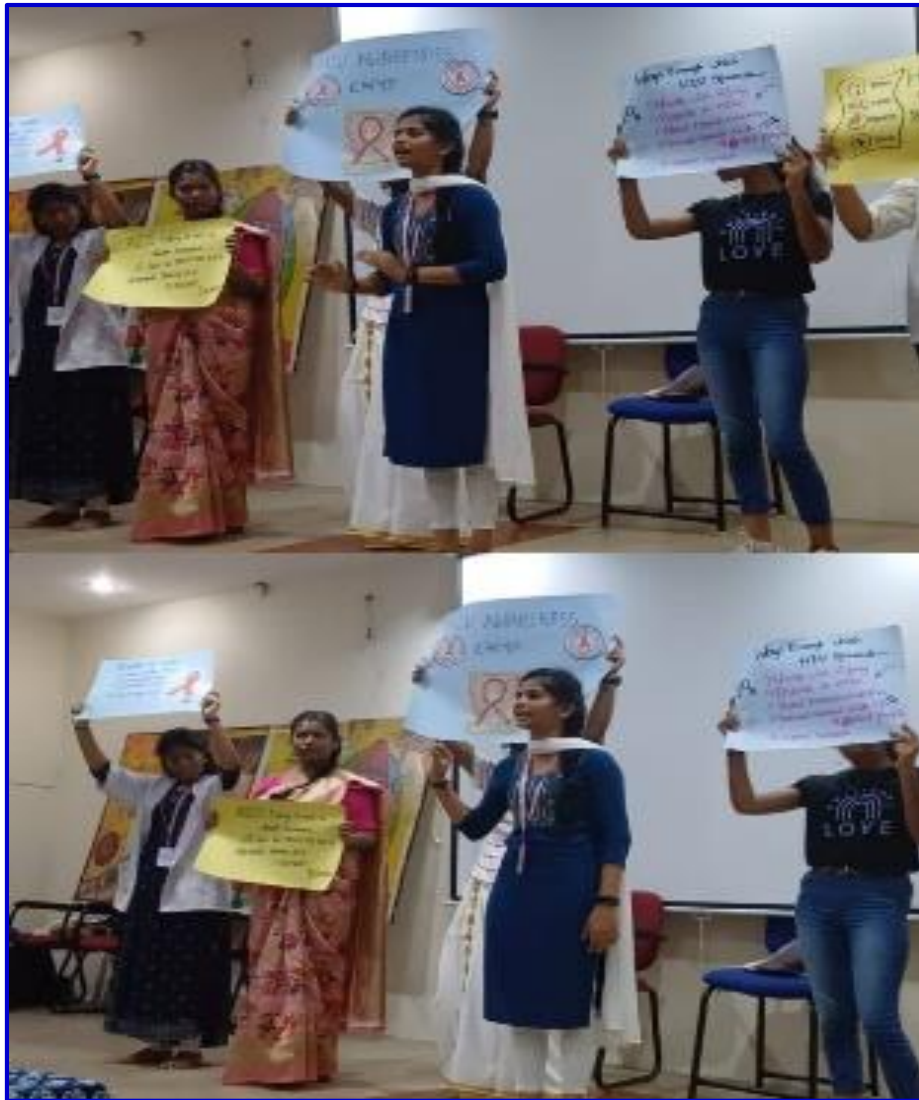
Aids Awareness Drama Competition - 01.03.2024