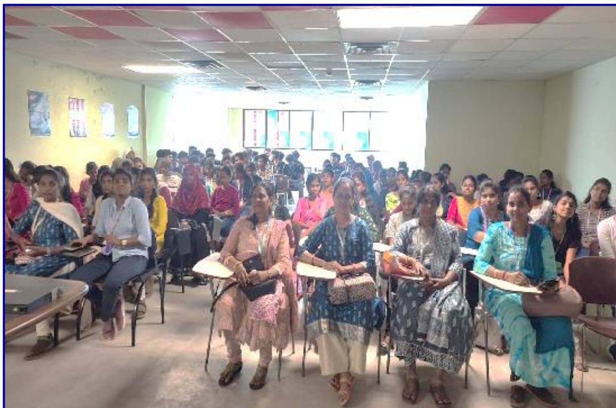
The Department of IT, EMGYWC organised an Industrial Visit to Spectrum Soft Tech Solution, Kochi, Kerala, on 07.02.2024