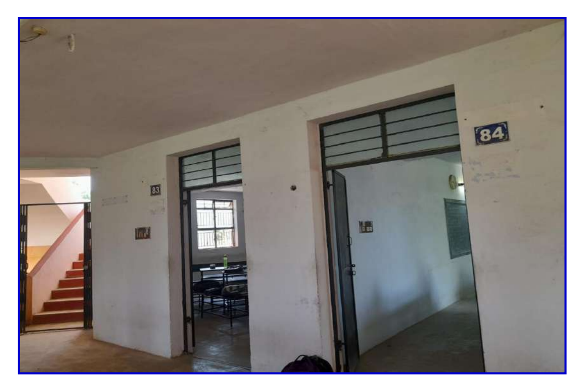
INFORMATION TECHNOLOGY UG CLASSROOMS