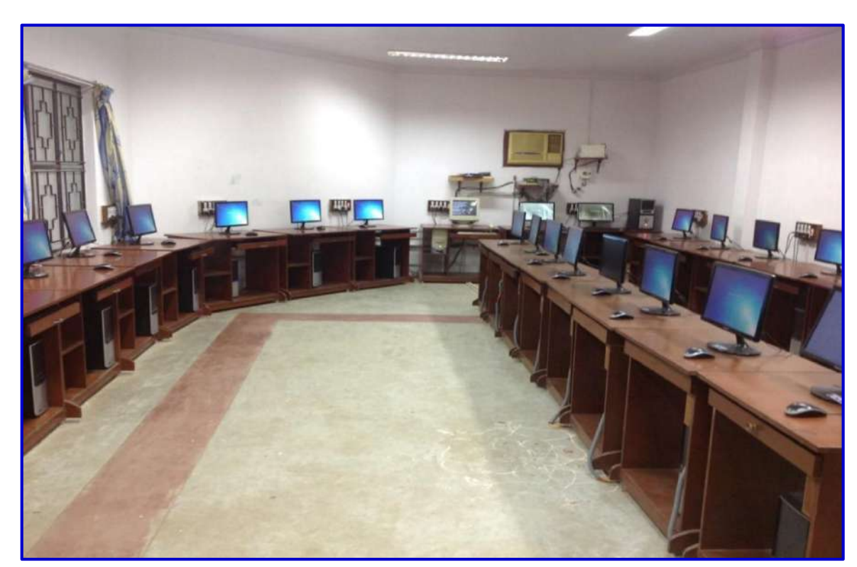
INFORMATION TECHNOLOGY UG LAB