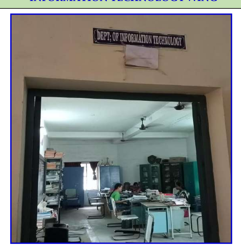
INFORMATION TECHNOLOGY DEPARTMENT