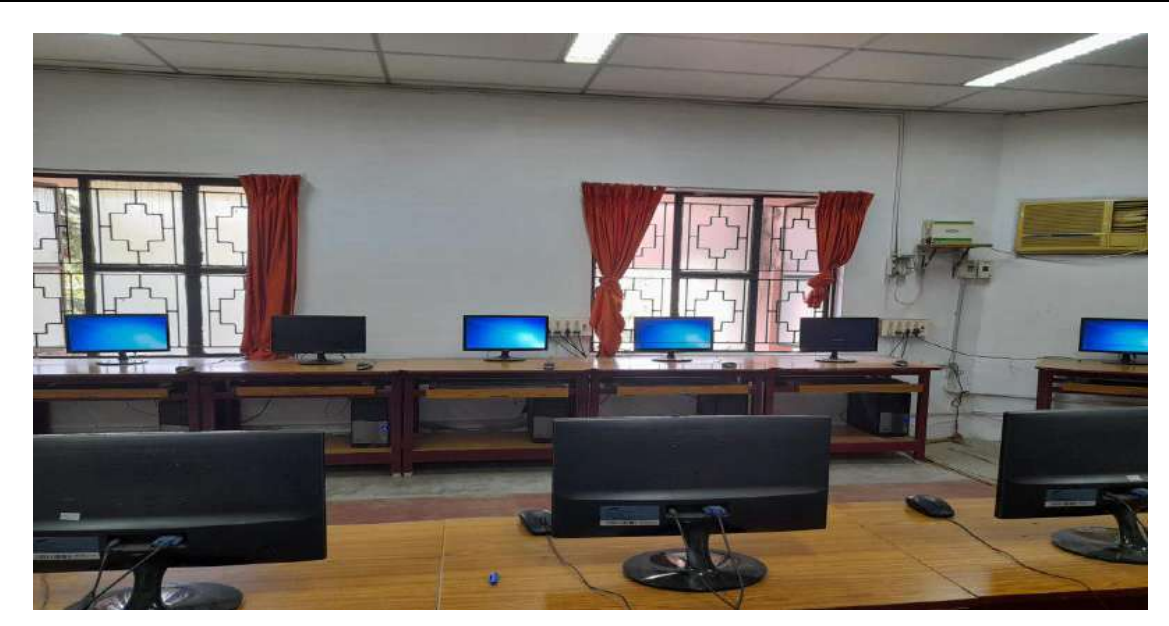
COMPUTER SCIENCE LAB 1