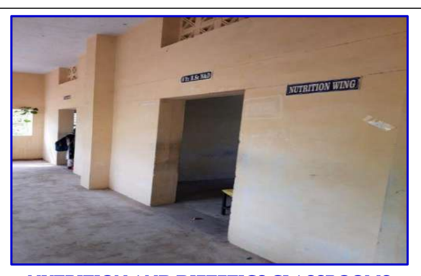
NUTRITION AND DIETETICS CLASSROOMS