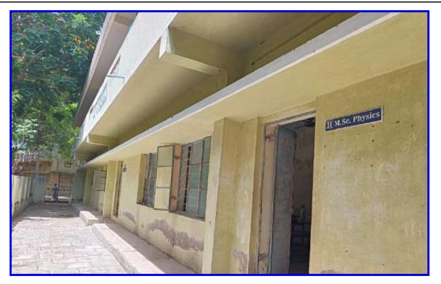
PHYSICS PG CLASSROOMS