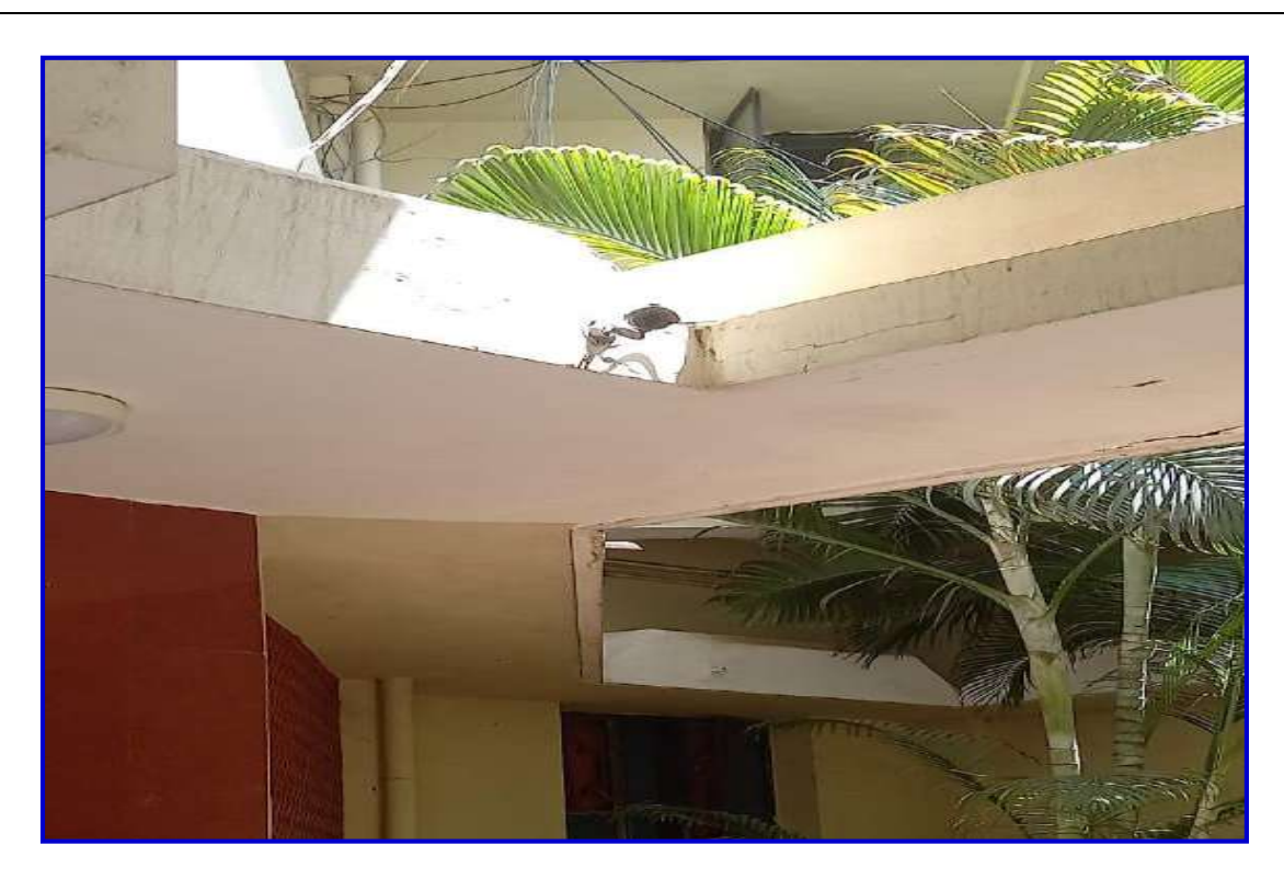
IN ADMIN BLOCK ENTRANCE