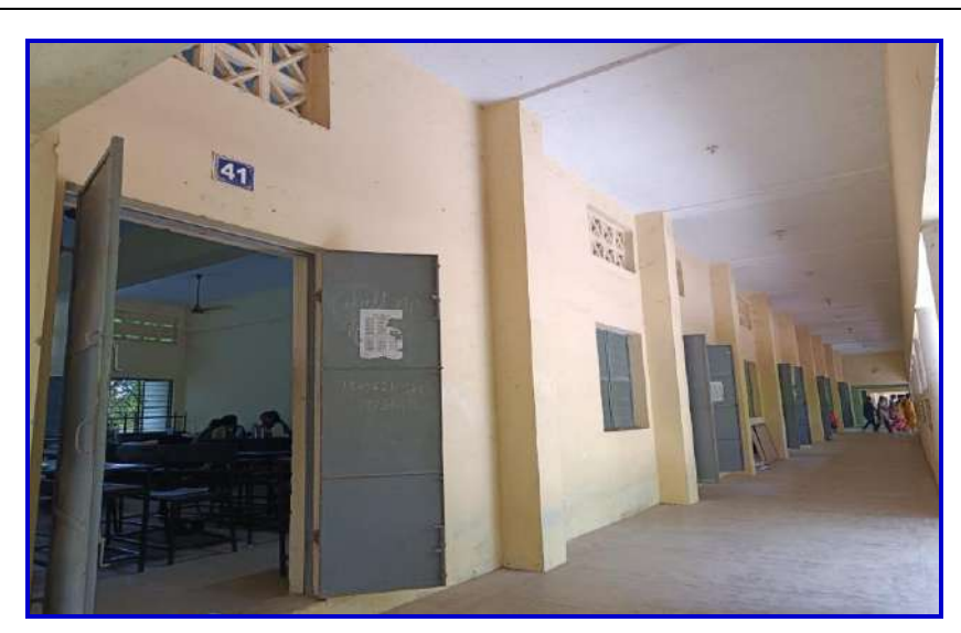
PHYSICS UG CLASSROOMS