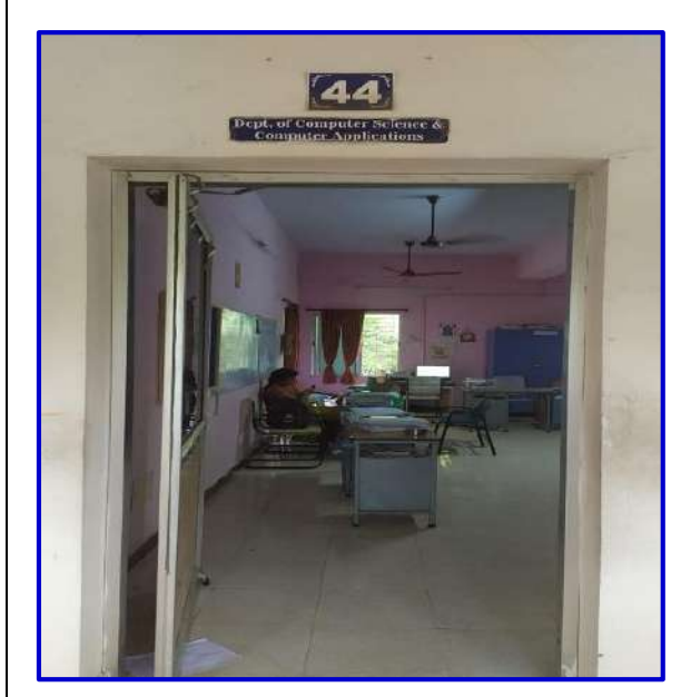
COMPUTER SCIENCE DEPARTMENT