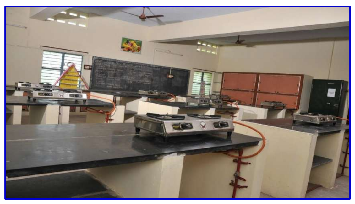
NUTRITION AND DIETETICS LAB