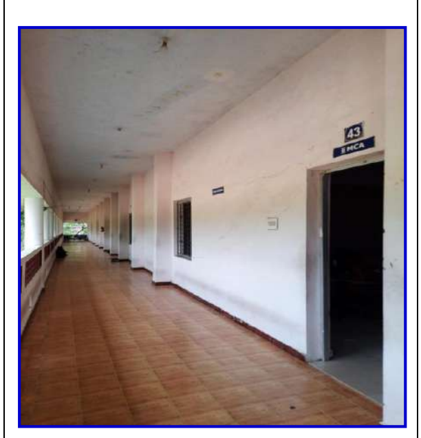
COMPUTER SCIENCE CLASSROOMS