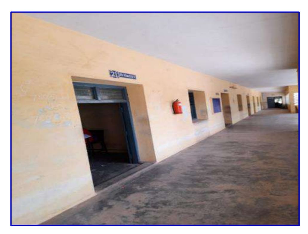
COMMERCE CLASS ROOMS