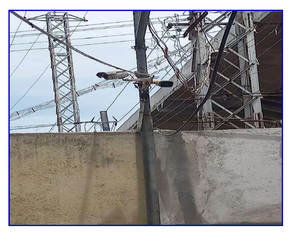
IN COMPOUND WALL