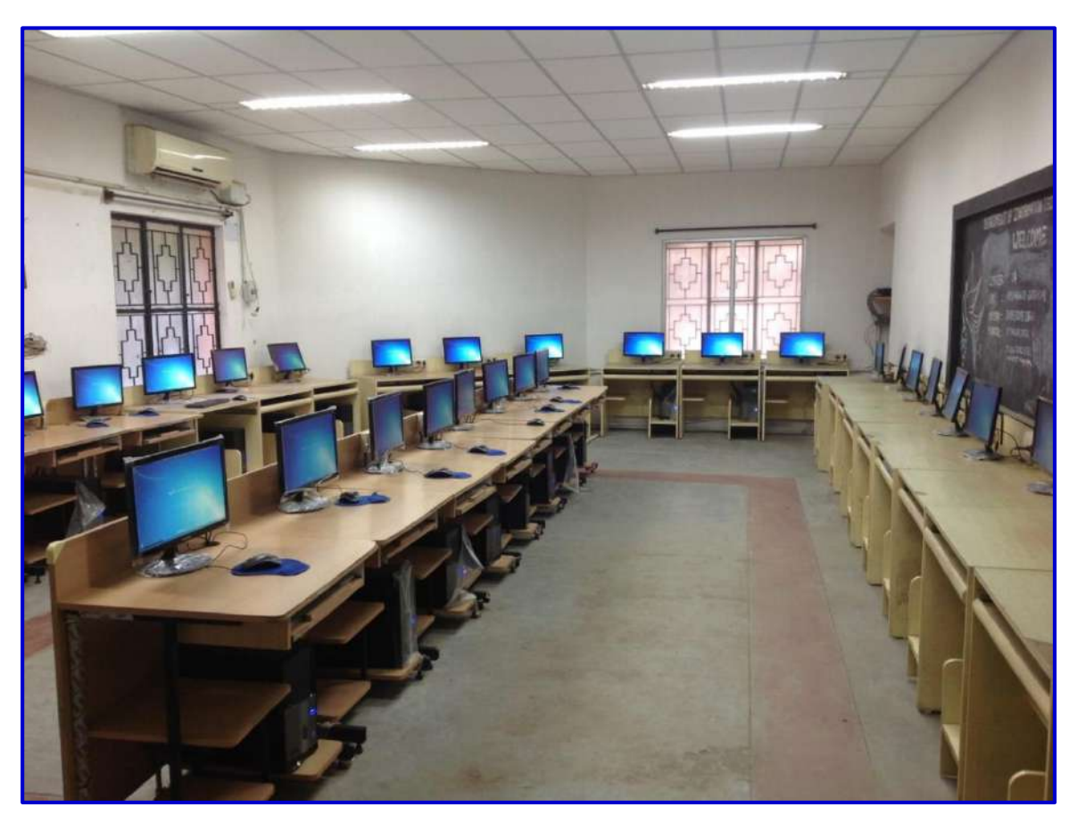
INFORMATION TECHNOLOGY PG LAB