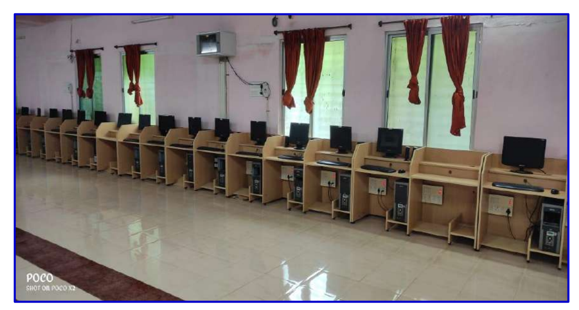
COMPUTER SCIENCE LAB2