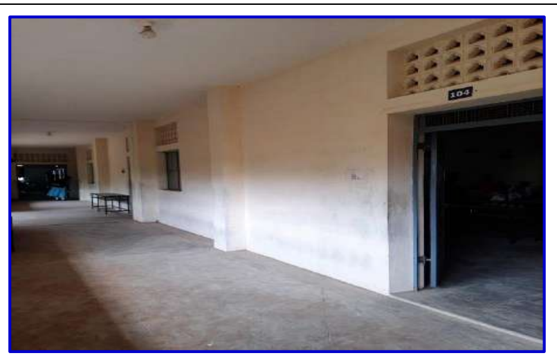
MATHEMATICS CLASS ROOMS