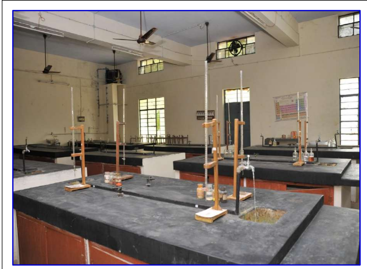
ALLIED CHEMISTRY LAB