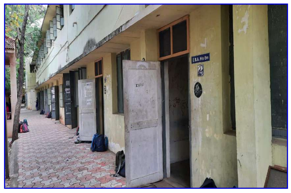
HISTORY CLASS ROOMS