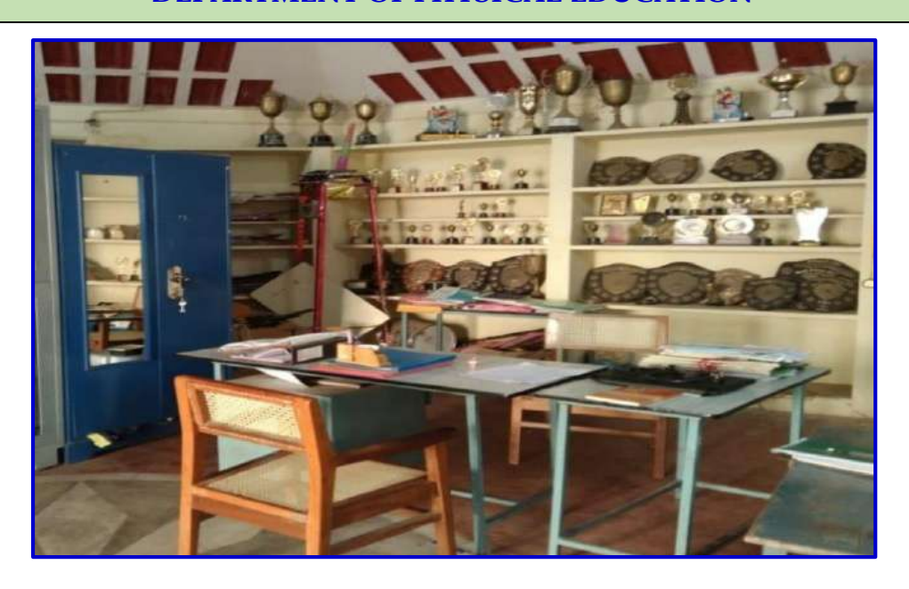
PHYSICAL EDUCATION ROOM