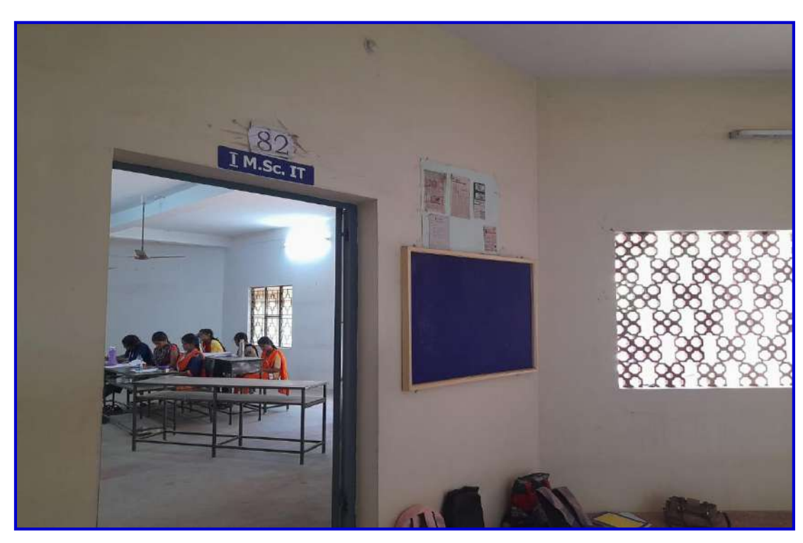
INFORMATION TECHNOLOGY PG CLASSROOMS