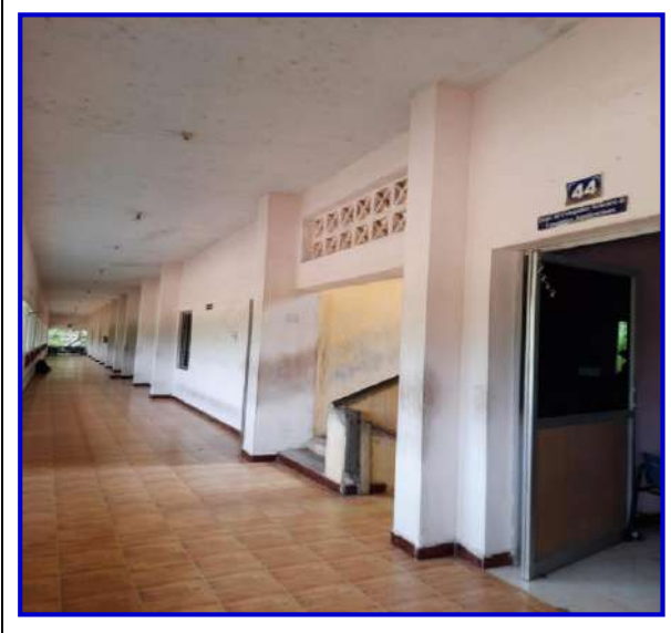
COMPUTER APPLICATIONS DEPARTMENT