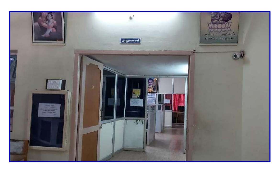
IN ADMINISTRATIVE OFFICE