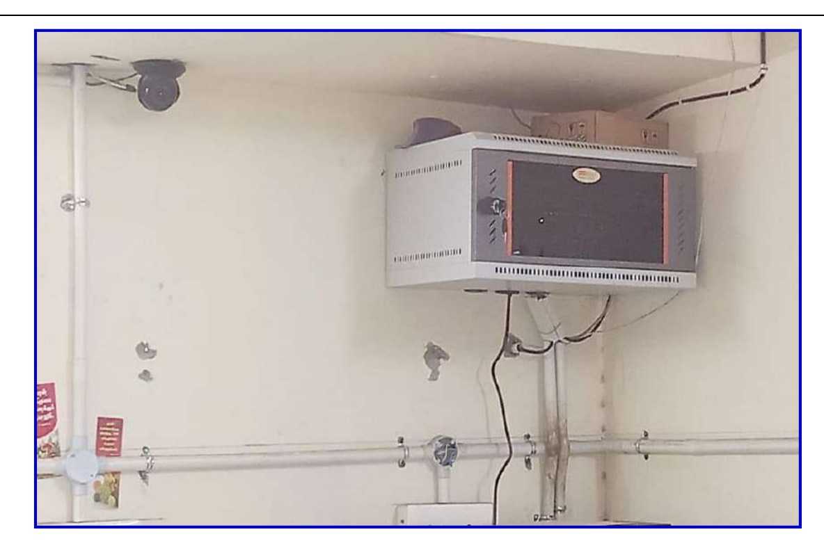
IN CONTROLLER OFFICE