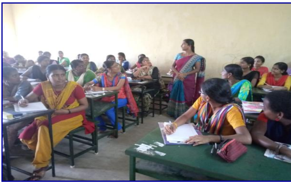
Bridge Course "Basic Terms in Chemistry" - 24.06.2019 to 01.07.2019