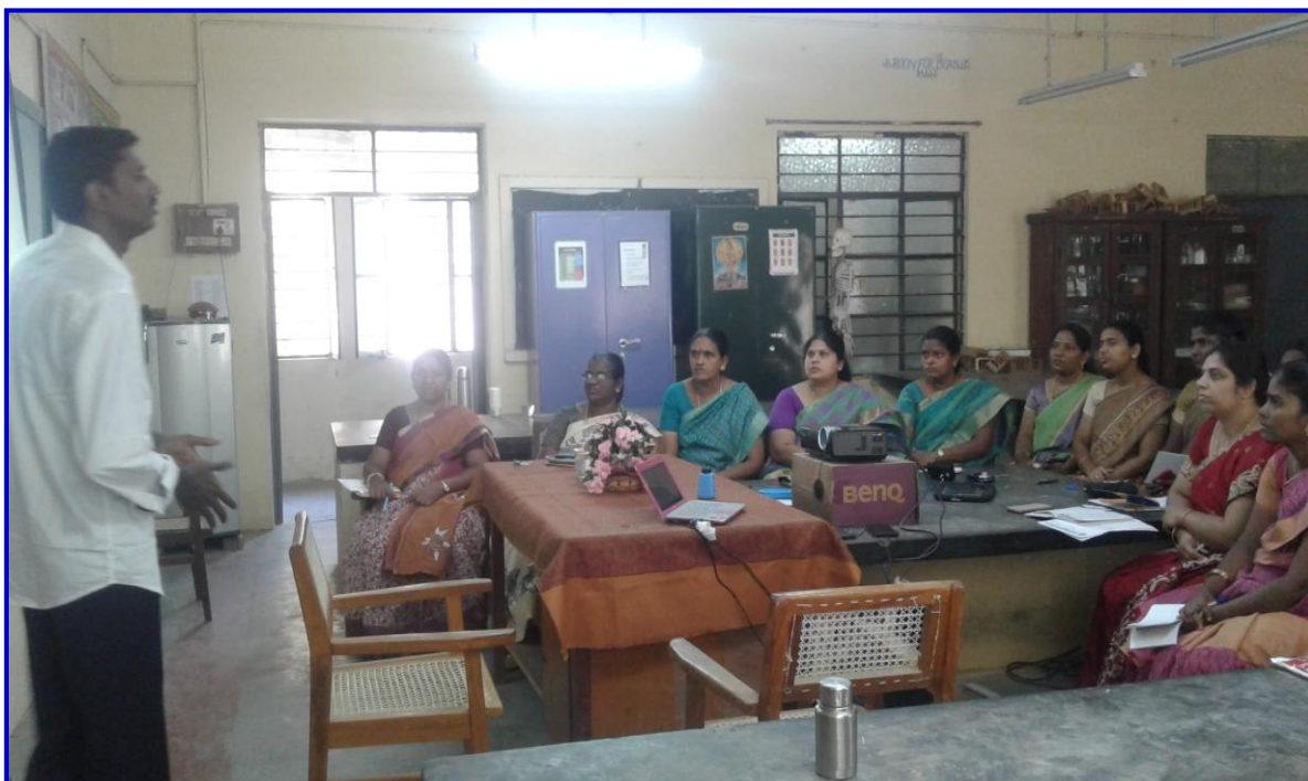
FDP: Guest Lecture on "Research and Development Funding Schemes" organised by Department of Zoology - 01.02.2018